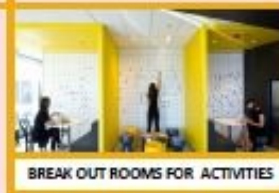
BREAK OUT ROOMS FOR ACTIVITIES